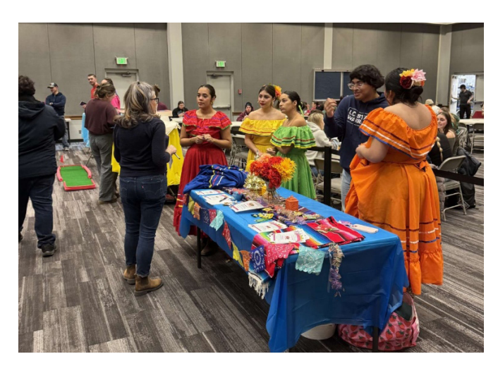
Club Fest 2025 with various clubs attending