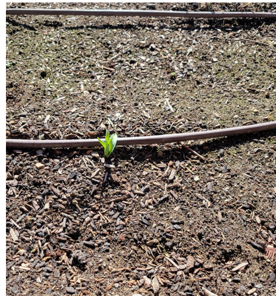
Top: the honor society garden by Craig Newsom