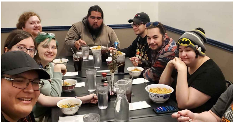
Gaming Club game night and trip to the Game-con in Moscow By Shaunasy Pashby

The cost-free holistic reproductive healthcare you deserve