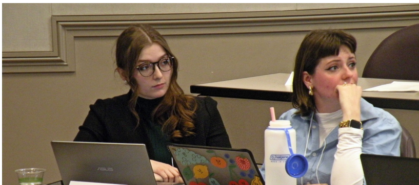
Right